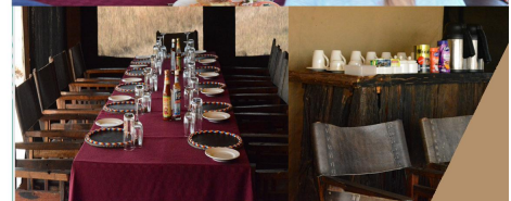
The Luxury Camp In Central Serengeti