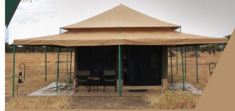
The Luxury Camp In Central Serengeti